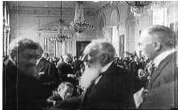
Signing the Treaty of Trianon on 4 June 1920. Albert Apponyi standing in the middle.

Negotiation is a dialogue between two or more people or parties, intended to reach an understanding, resolve point of difference, or gain advantage in outcome of dialogue, to produce an agreement upon courses of action, to bargain for individual or collective advantage, to craft outcomes to satisfy various interests of two people/parties involved in negotiation process. Negotiation is a process where each party involved in negotiating tries to gain an advantage for themselves by the end of the process. Negotiation is intended to aim at compromise.