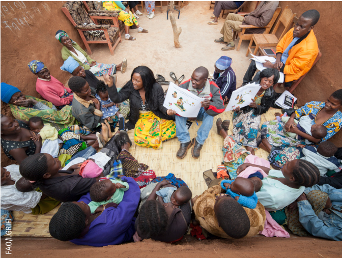
Nutrition Education in Malawi