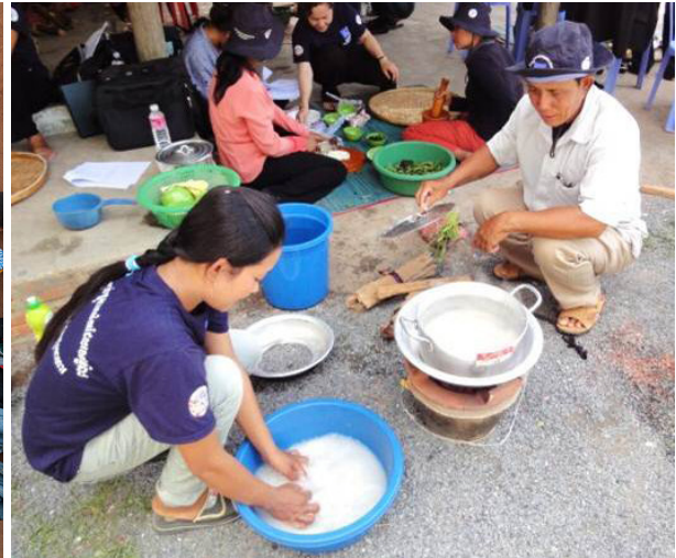
Participatory cooking sessions in Cambodia

lateral support to governments or NGOs. The terminology has also spread through public health professionals returning from studies in the United States (US), the United Nations Children’s Fund (UNICEF) and the World Bank use “behavior change communication” as do donors including the UK Department for International Development (DFID), the Canadian International Development Agency (CIDA), and the Australian Agency for International Development (AUSAID). All of these entities use BCC for a wide range of health behaviors, including nutrition, particularly breastfeeding and complementary feeding. WHO staff report that the term is also entering the lexicon in Geneva. USAID-funded programs in agriculture and food security are also adopting the term and concepts of BCC (Feed the Future, 2012).