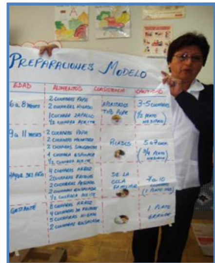
A government nurse in Ayacucho (Peru) with a poster she made to show age-appropriate diversified meals for young children.

The most common method of nutrition education is counseling, but increasingly, health facility staff or community health volunteers also conduct cooking demonstrations for groups or make home visits to assist families with skills for improving food preparation