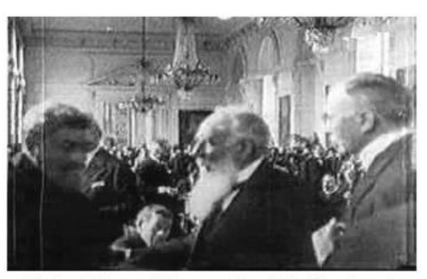
Signing the Treaty of Trianon on 4 June 1920. Albert Apponyi standing in the middle.

Negotiation is a dialogue between two or more people or parties, intended to reach an understanding, resolve point of difference, or gain advantage in outcome of dialogue, to produce an agreement upon courses of action, to bargain for individual or collective advantage, to craft outcomes to satisfy various interests of two people/parties involved in negotiation process. Negotiation is a process where each party involved in negotiating tries